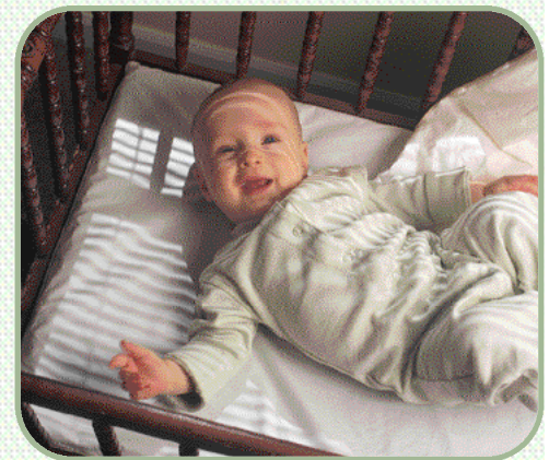
Starlight Support Cradle Mattress

Call Moonlight Slumber today to learn more about Starlight Support mattresses for cribs, cradles, and changing tables.