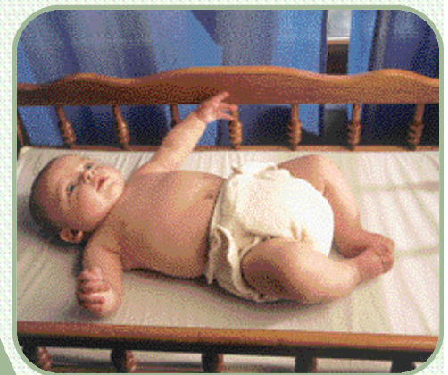
Starlight Support Changing Pad